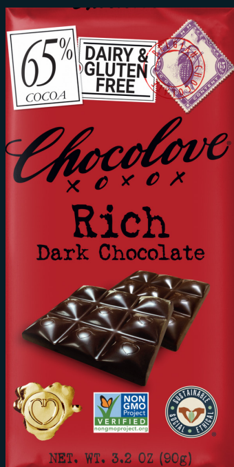
CHOCOLOVE RICH DARK CHOCOLATE BAR $39/case of 12