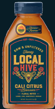
RICE'S HONEY CALI CITRUS BLOSSOM $14.99