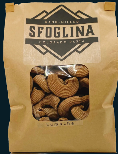
SFOGLINA LUMACHE $9