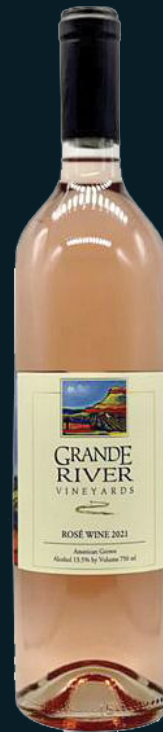
GRANDE RIVER VINEYARDS 2021 ROSÉ