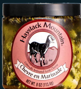
HAYSTACK MOUNTAIN CHEVRE EN MARINADE