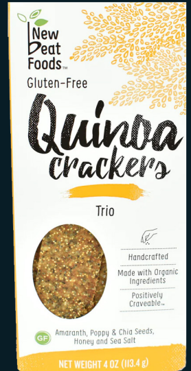
NEW BEAT FOODS TRIO QUINOA CRACKERS $8