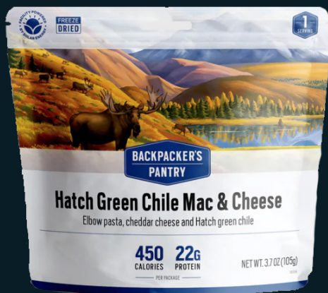
BACKPACKER'S PANTRY HATCH GREEN CHILE MAC & CHEESE $6.99