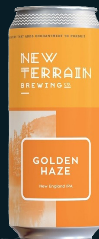
NEW TERRAIN BREWING GOLDEN HAZE NEW ENGLAND IPA